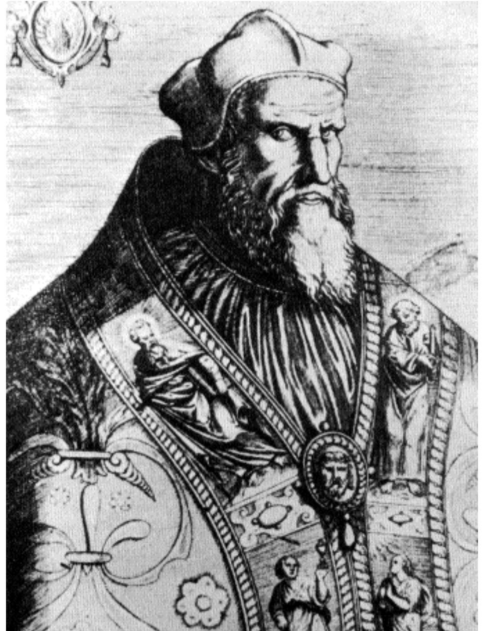
Gregory XIII, the Great—Pope (1572-1585), corrected the error in the Julian calendar. His calendar, the Gregorian calendar, is presently in use.

Now the British countries refused to change the calendar when the pope ordered it. They continued with the old Julian calendar until 1752. And while their days of the month were different, yet their days of the week were JUST THE SAME AS IN ROME. Those who kept the Sabbath in England kept the same SATURDAY that was called Saturday in Rome. Those who observed Sunday observed the same day, both in Rome where