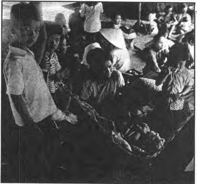
Pain Truth Photos

piasters at the expense of others. There was growing antagonism in the streets against corruption in high places. It was OK to be corrupt when times were good and everyone got their fair share, but these were hard times!