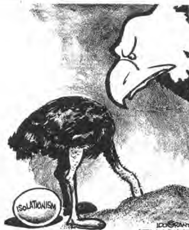
"WHAT'S THIS... OUR NEW NATIONAL BIRD?"

However, if the worst happens in Korea, Japan would be forced to reexamine its own defense arrangements with the United States. Presently shaded by the U.S. "nuclear umbrella," Japan might even feel compelled to "go nuclear." Such a development would greatly destabilize an already shaky world. □