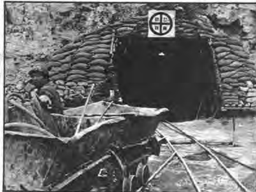
ENTRANCE to U.N.-dug intercept tunnel used to detect North Korean infiltration tunnels across Demilitarized Zone.

Recently, South Korea's Christian clergy, both Roman Catholic and Protestant, have become President Park's most severe critics. They have been outspokenly condemning