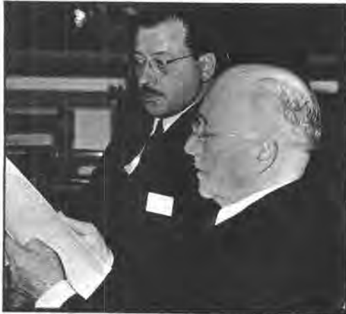
JEAN MONNET, 86, the "Father of Europe" (foreground).

BRUSSELS: "If the governments of Europe don't have the will to build Europe, they should not maintain the illusion that they do."