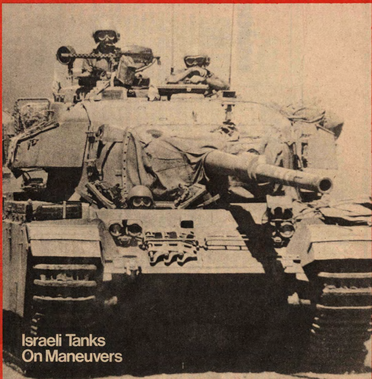
Israeli Tanks On Maneuvers