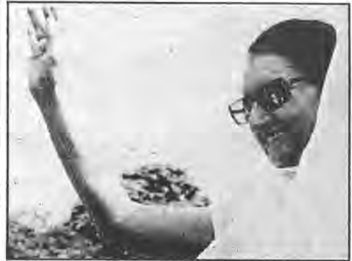
DEFIANT GESTURE: India's Prime Minister Indira Gandhi waves to supporters following her lower court conviction of corruption in the 1971 election campaign.