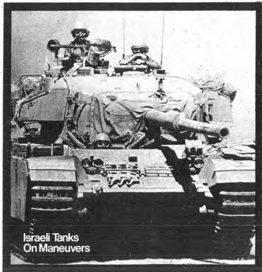
Israeli Tanks On Maneuvers