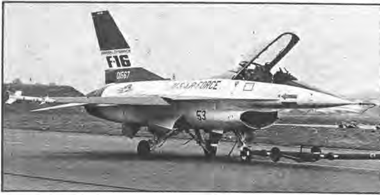
THE $2 BILLION WINNER: American-made F-16 fighter on display at recent Paris Air Show. Jet, built by General Dynamics, won the "arms deal of the century" when NATO partners Belgium, the Netherlands, Norway and Denmark picked the F-16 over latest version of the French Mirage for their air forces. Despite continued heavy dependence upon the United States, European members of NATO want to more closely co-ordinate their own defense needs.