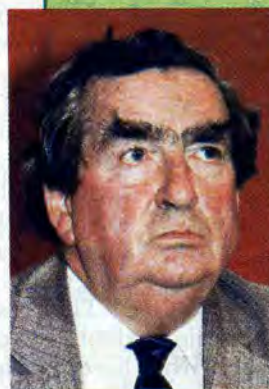
Denis Healy, former British Chancellor of the Exchequer

Spread across the world, this enormous debt would provide every