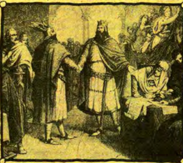
1183. Frederick I Barbarossa signs a treaty with the Lombards, furthering his ambitions of a revived Roman Empire in the ancient sense.