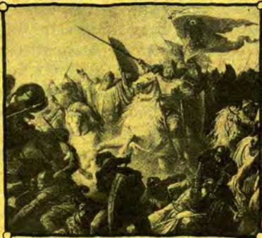
A.D. 955. Otto I halts the invasions of the Magyars at Lechfeld.