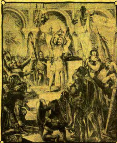
1229. Frederick II crowns himself with the Crown of the Holy Land, at Jerusalem, in defiance of the Pope.