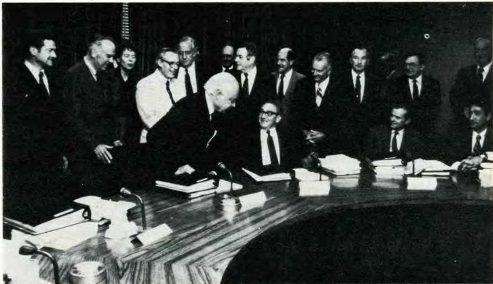
A session of the National Bipartisan Commission on Central America, presided over by former U.S. Secretary of State Henry Kissinger, seated center.

A radar base near the capital of Tegucigalpa monitors air traffic over the region. Runways are being