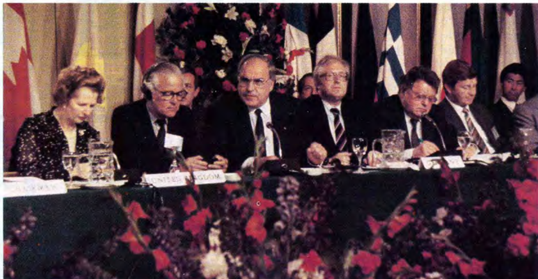
Leaders of the European Democrat Union and the Pacific Democrat Union joined forces in London in late June to form the International Democrat Union.

dominion of mind and spirit.” West Germany’s Franz Josef Strauss concluded, “The coming together today represents a spiritual confrontation with Marxism.”