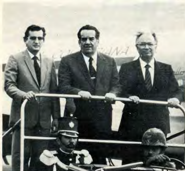
U.S. special envoy to Central America, Richard B. Stone, right, visits with Honduran President Roberto Suazo Cordova, center.

country increasingly into the arms of Moscow and Havana. War between Nicaragua and Honduras is a greater likelihood than ever—with the possibility, some believe, of pulling the United States right along with it.