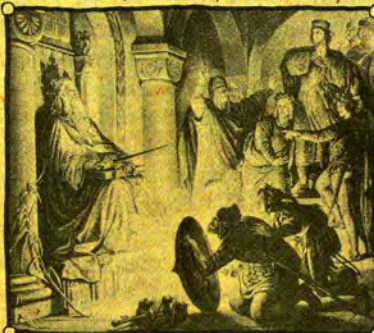
Circa 1000. Otto III visits the grave of Charlemagne, founder of the Holy Roman Empire.