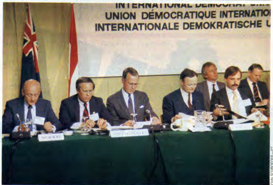
At the birth of the International Democrat Union (IDU), its leaders claimed the support of 150 million people, double the support of the Socialist International. These figures mean little in the world of international politics.

Human groups are in a constant state of confusion. Some members are always splitting off to form other groups. And the purposes, aims and goals of any one group tend to change over time. In the end it seems people unite to eventually divide.