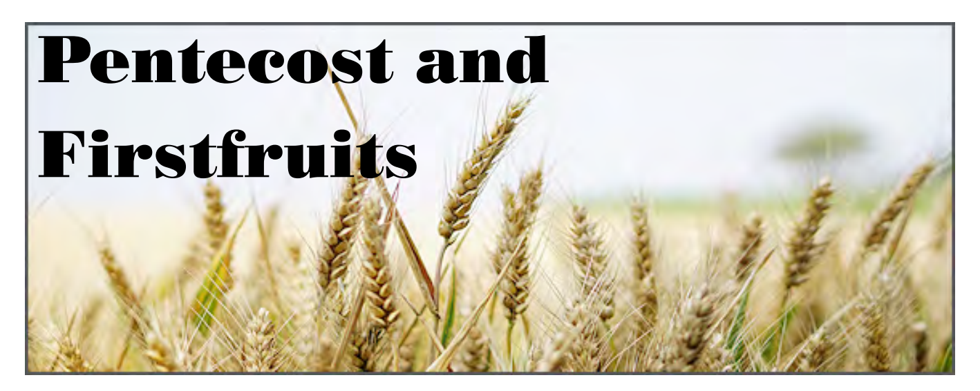
Of his own will begat he us with the word of truth, that we should be a kind of firstfruits of his creatures (James 1:18).